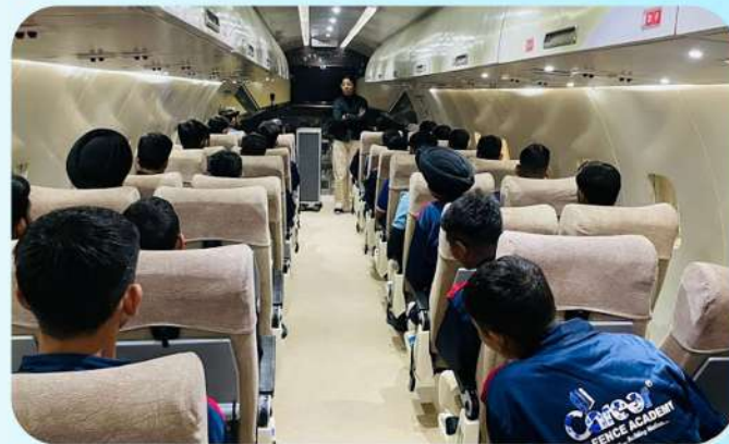
VISIT TO CHANDIGARH UNIVERSITY (19 JAN 2024)