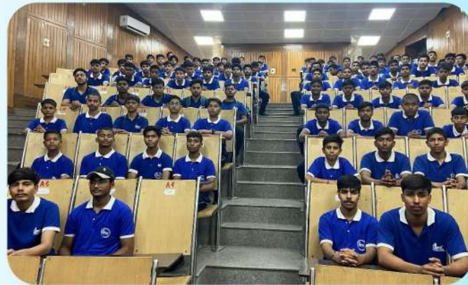
VISIT TO IIT DELHI (01 MAY 2025)