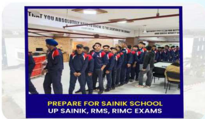
VISIT TO CHITKARA UNIVERSITY, RAJPURA (23 JAN 2025)