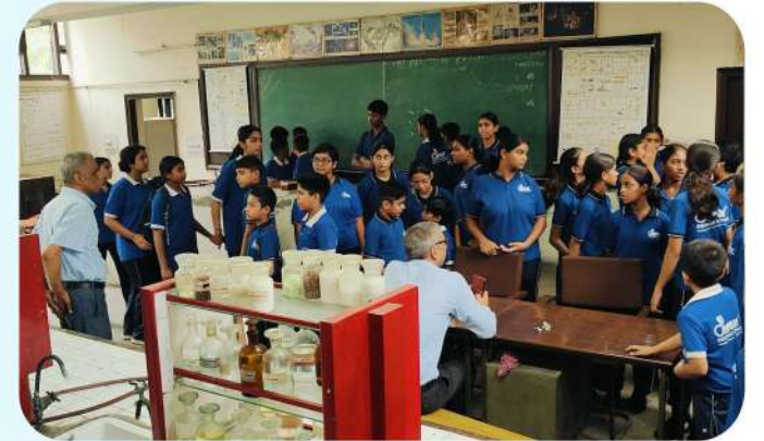
VISIT TO MOTILAL NEHRU SCHOOL OF SPORTS, SONIPAT (05 AUG 2025)