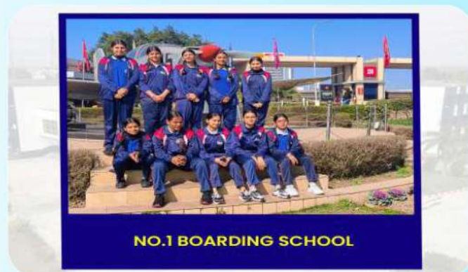
NO.1 BOARDING SCHOOL