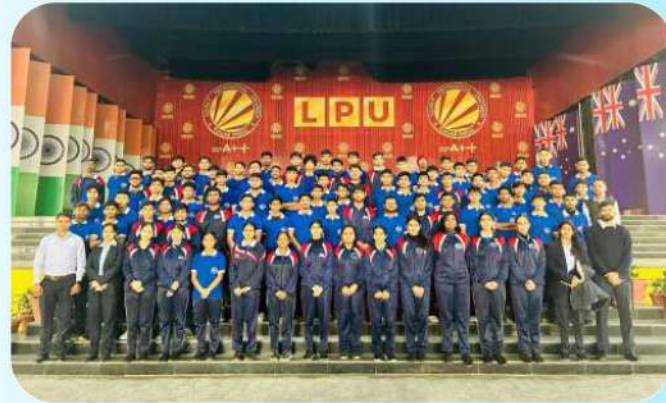
VISIT TO LOVELY PROFESSIONAL UNIVERSITY (26 NOV 2024)