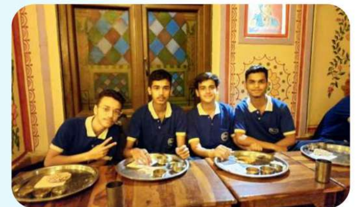
VISIT TO CHOKHI DHANI (05 MAY 2024)