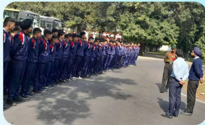
VISIT TO IMA DEHRADUN (30 NOV 2024)