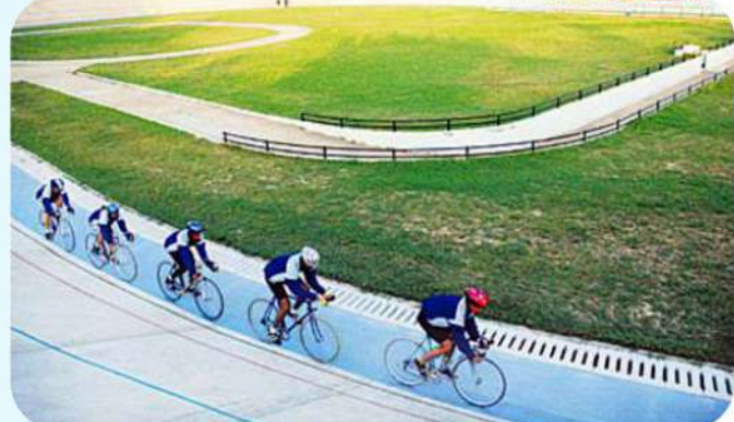
VISIT TO NIS PATIALA (23 JAN 2025)