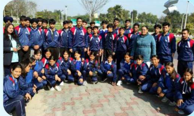
VISIT TO IIT ROPAR (11 FEB 2025)