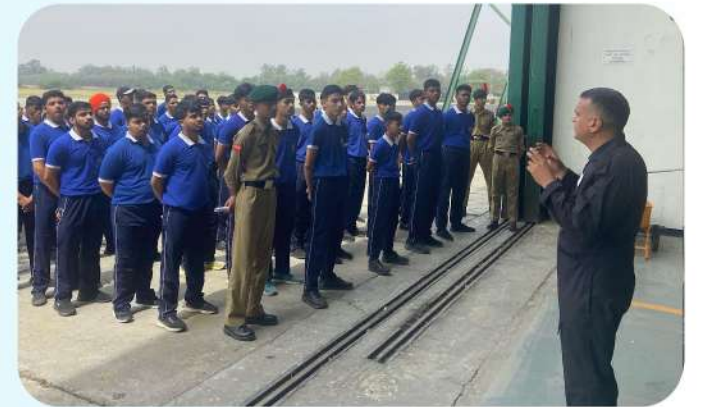
VISIT TO AVIATION AIR BASE, PATIALA (19 APRIL 2025)