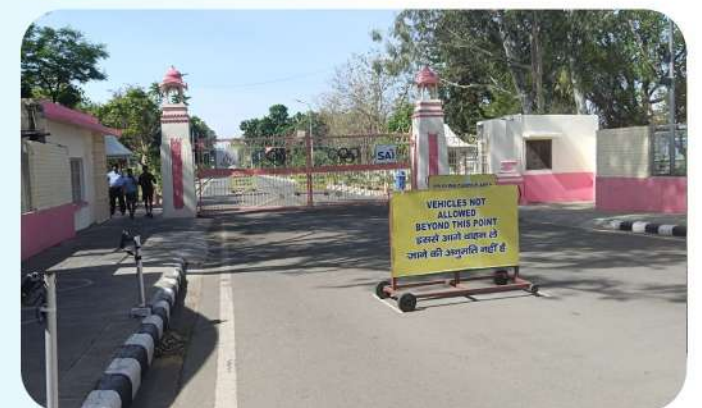
VISIT TO NIS PATIALA (18 APRIL 2024)