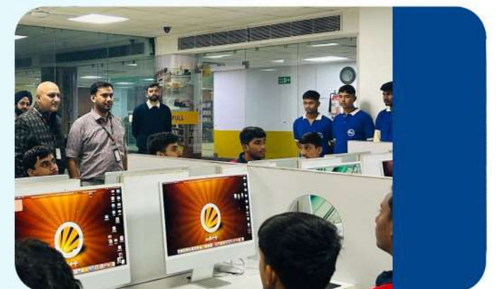
VISIT TO LOVELY PROFESSIONAL UNIVERSITY (26 NOV 2024)