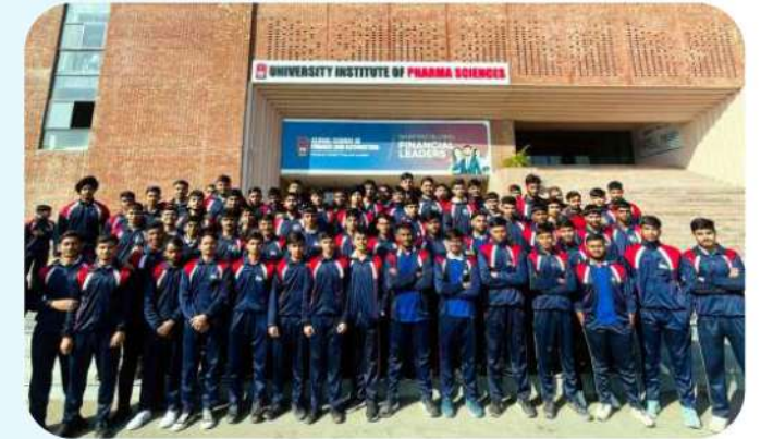
VISIT TO CHD UNIVERSITY (19 JAN 2024)