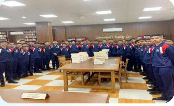
Indian Military Academy (IMA) Visit