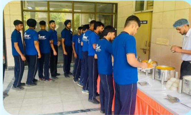
VISIT TO AIMA, NOIDA (16 SEP 2025)