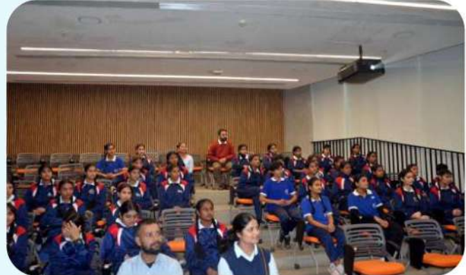
VISIT TO THAPAR UNIVERSITY, PATIALA (07 AUG 2025)