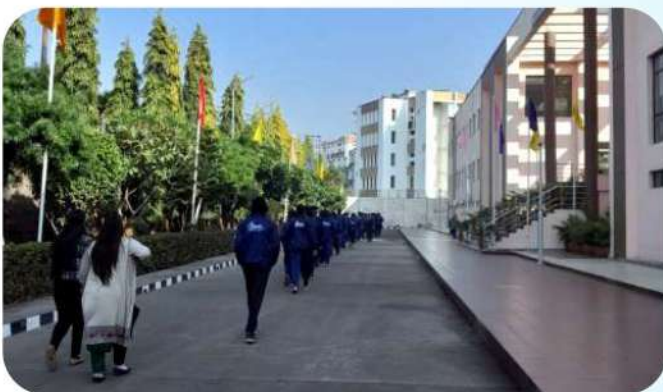
VISIT TO ICFAI UNIVERSITY (20 JAN 2024)