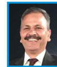
BRIGADIER SS JOON (RETD)